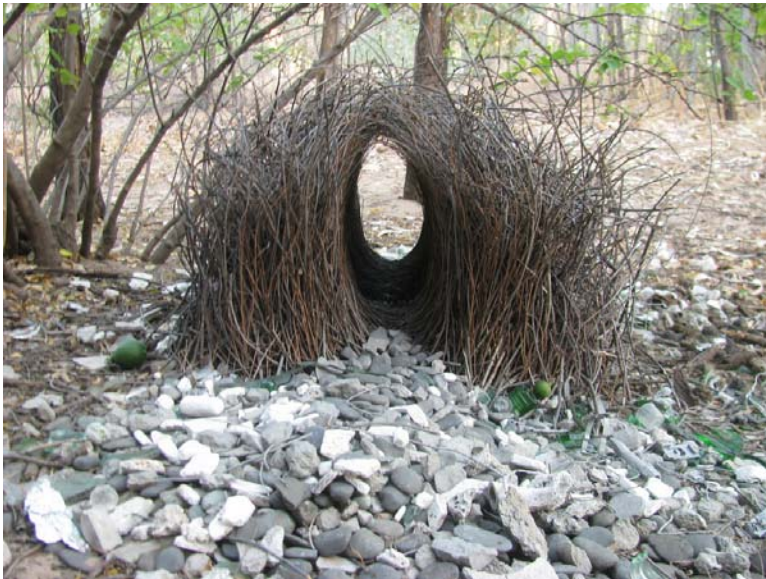
Photo Credit: http://www.flickr.com/photos/katieandtommy/ Creative Commons - Bowerbird

After a prolonged date with destiny that is now approaching 3 years, my wife and I stepped into a suburban open space to rendezvous with nature as we have done so many times before. It was during a nighttime walk four months back that we crossed paths with a Burrowing Owl who returned to a patch of land sandwiched between all the fixings of suburbia. From that first sighting, we made it routine to stop by for a short visit and even celebrated the appearance of his mate.